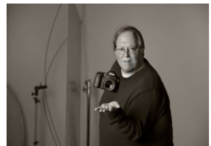
Advanced Black/White Bill Cole